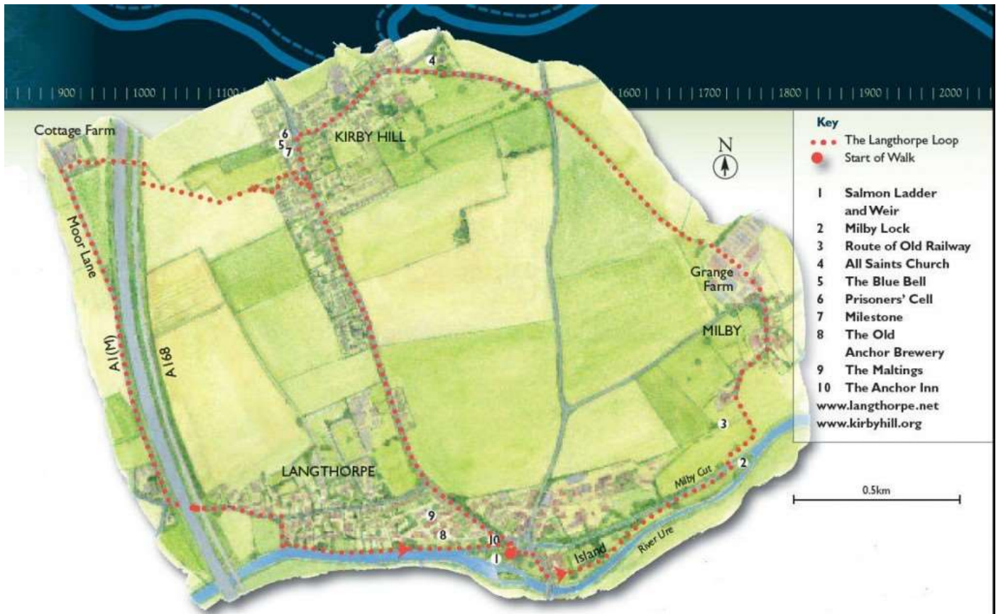
Illustrative “Walkers Are Welcome” map showing the Langthorpe Loop

SUMMARY: an excellent, very easy local walk with many points of historical and cultural interest along the route