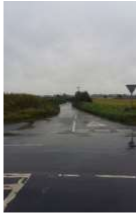
(E) Scaldhill Lane from Dishforth Rd