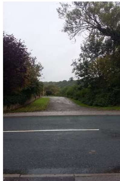
(S) Right turn to the riverbank path, near the end of the walk, just before The Fox & Hound