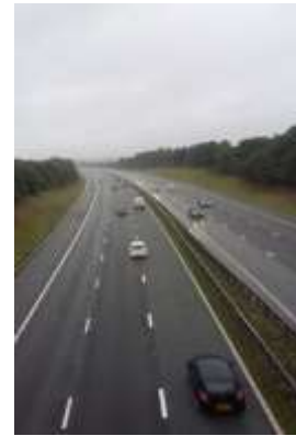
(S) From bridge over A1