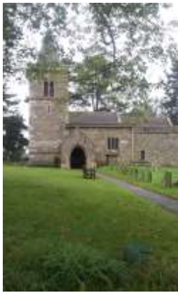
(S) Kirby Hill Church (4, above)