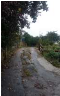
(S) Turn-off from Leeming Lane, leading to A1 crossing