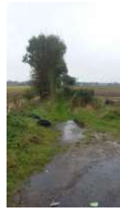
(S) "Green Lane" : Milby - Kirby Hill