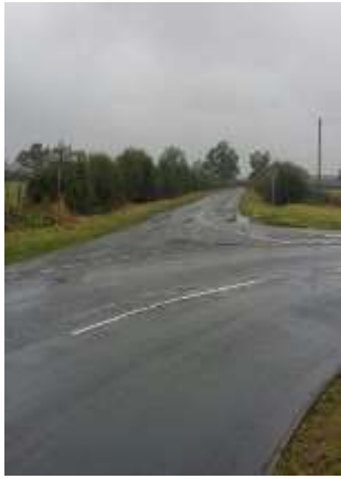
(E) Start of Scaldhill Lane from Helperby Rd