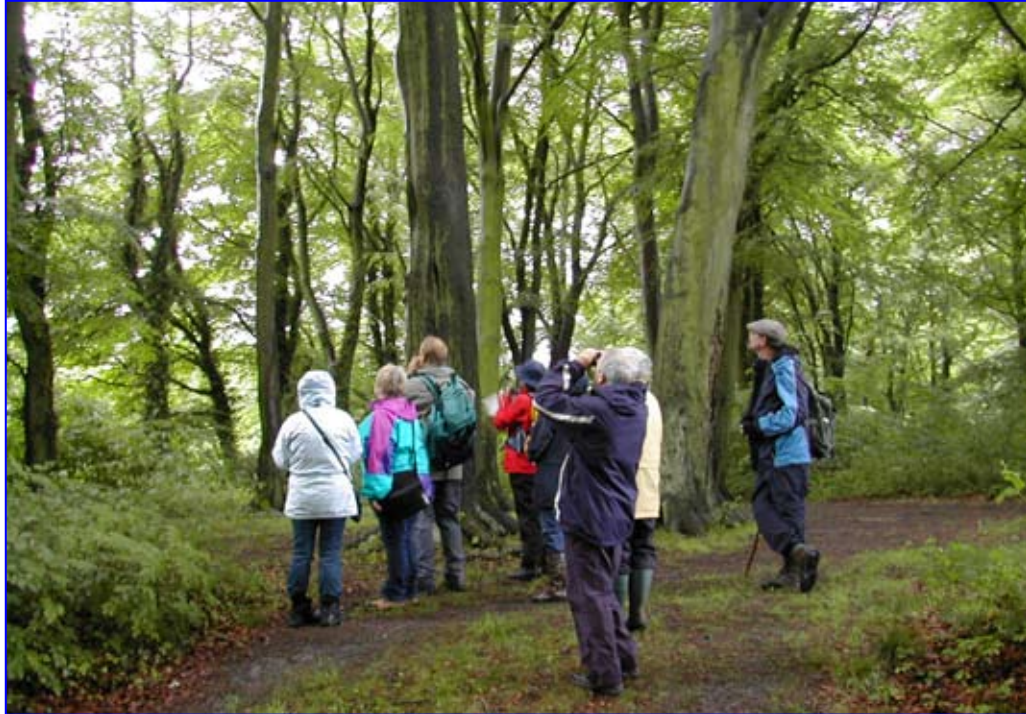
Birdwatching on the Cockshutt (A Walkabout Wrekin event)

Produced by Wrockwardine Wood & Trench Parish Council. Issue No.30, Dec. 2012