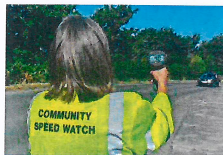
Speed Watch equipment in action

Full training will be given on the equipment operation, and high-visibility clothing will be supplied.