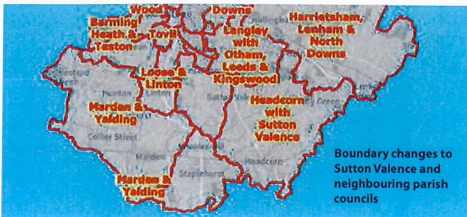
Boundary changes to Sutton Valence and neighbouring parish councils

The map below shows how our neighbouring parish councils boundaries will also change following the review.